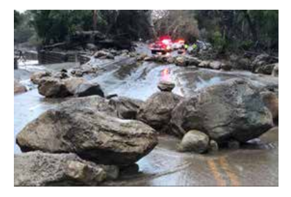
What Led to the Montecito Disaster?

Happy anniversary to the University of California! Founded in 1868 in Oakland, CA, the UC has grown to become one of the world's most stellar university systems encompassing more than 238,000 students, 190,000 faculty and staff, and 1.7 million alumni around the world. Celebratory events will be held in Sacramento, San Francisco, Los Angeles and other locations. See the cool video and history timeline here.