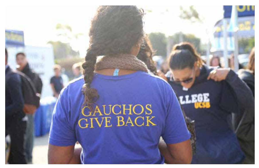
Join the worldwide Gaucho movement to help others through a service project of your choice. By combining our skills, talents and interests we can make life better for everyone.

Unite, Serve, Achieve First Annual UCSB Alumni Day of Service 2.24.18